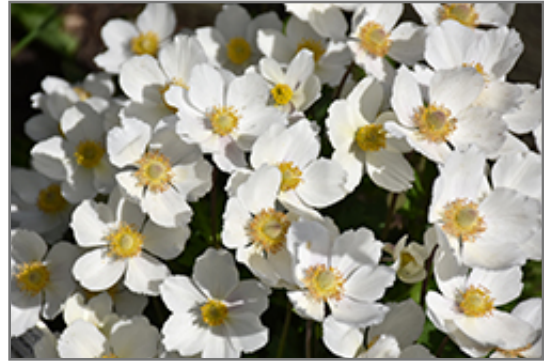
Windflower flowers

Windflower is recommended for the following landscape applications;