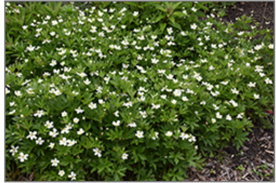
Windflower in bloom

Windflower will grow to be about 12 inches tall at maturity, with a spread of 18 inches. Its foliage tends to remain dense right to the ground, not requiring facer plants in front. It grows at a fast rate, and under ideal conditions can be expected to live for approximately 10 years. As an herbaceous perennial, this plant will usually die back to the crown each winter, and will regrow from the base each spring. Be careful not to disturb the crown in late winter when it may not be readily seen!