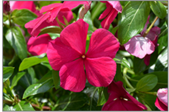
Valiant Burgundy Vinca flowers

Valiant Burgundy Vinca will grow to be about 12 inches tall at maturity, with a spread of 18 inches. Its foliage tends to remain dense right to the ground, not requiring facer plants in front. Although it's not a true annual, this fast-growing plant can be expected to behave as an annual in our climate if left outdoors over the winter, usually needing replacement the following year. As such, gardeners should take into consideration that it will perform differently than it would in its native habitat.