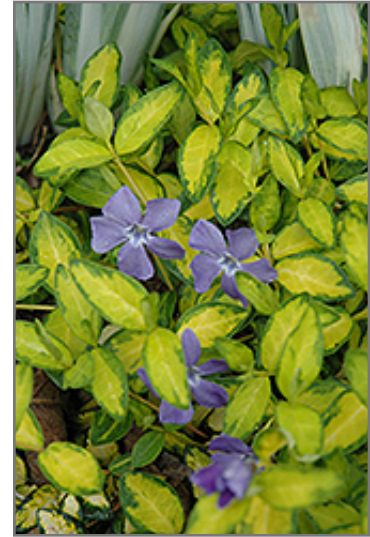
Illumination Periwinkle flowers

Illumination Periwinkle is a fine choice for the garden, but it is also a good selection for planting in outdoor pots and containers. Because of its spreading habit of growth, it is ideally suited for use as a 'spiller' in the 'spiller-thriller-filler' container combination; plant it near the edges where it can spill gracefully over the pot. Note that when growing plants in outdoor containers and baskets, they may require more frequent waterings than they would in the yard or garden. Be aware that in our climate, most plants cannot be expected to survive the winter if left in containers outdoors, and this plant is no exception. Contact our experts for more information on how to protect it over the winter months.