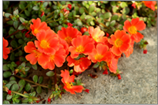
RioGrande Orange Portulaca flowers

RioGrande Orange Portulaca is recommended for the following landscape applications;