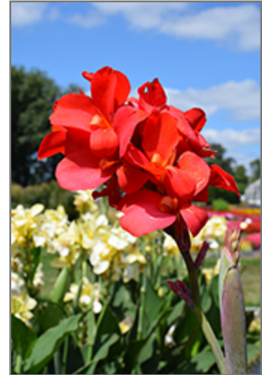
Cannova Bronze Scarlet Canna flowers

Cannova Bronze Scarlet Canna is a fine choice for the garden, but it is also a good selection for planting in outdoor pots and containers. With its upright habit of growth, it is best suited for use as a 'thriller' in the 'spiller-thriller-filler' container combination; plant it near the center of the pot, surrounded by smaller plants and those that spill over the edges. It is even sizeable enough that it can be grown alone in a suitable container. Note that when growing plants in outdoor containers and baskets, they may require more frequent waterings than they would in the yard or garden. Be aware that in our climate, most plants cannot be expected to survive the winter if left in containers outdoors, and this plant is no exception. Contact our experts for more information on how to protect it over the winter months.