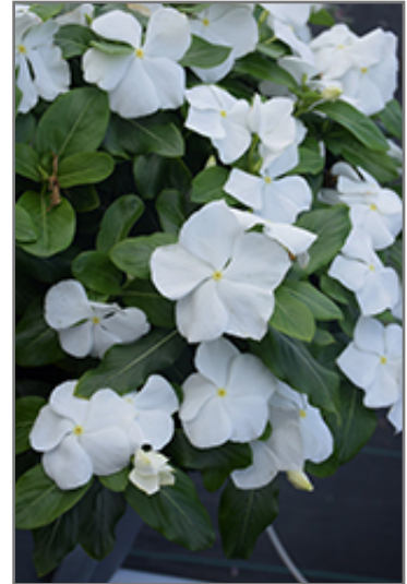
Titan Pure White Vinca flowers

Titan Pure White Vinca is recommended for the following landscape applications;