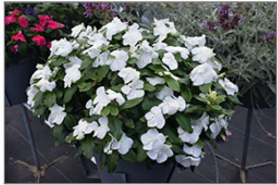
Titan Pure White Vinca in bloom

Titan Pure White Vinca will grow to be about 14 inches tall at maturity, with a spread of 12 inches. Its foliage tends to remain dense right to the ground, not requiring facer plants in front. Although it's not a true annual, this fast-growing plant can be expected to behave as an annual in our climate if left outdoors over the winter, usually needing replacement the following year. As such, gardeners should take into consideration that it will perform differently than it would in its native habitat.