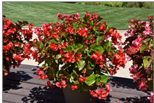
Whopper Red Green Leaf Begonia flowers