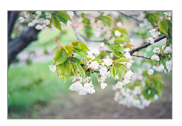
Van Cherry flowers