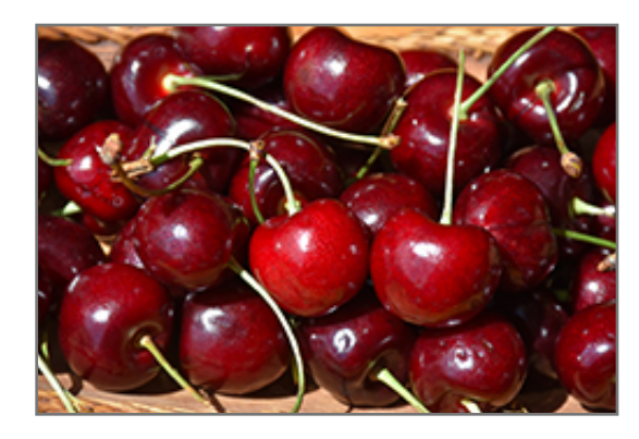
Van Cherry fruit