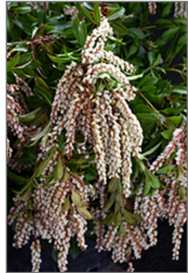
Mountain Fire Japanese Pieris flowers