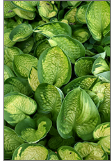
Rainforest Sunrise Hosta foliage

Rainforest Sunrise Hosta is recommended for the following landscape applications;