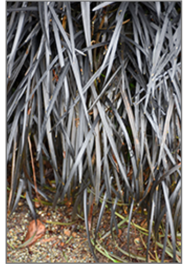
Black Mondo Grass foliage

Black Mondo Grass is a fine choice for the garden, but it is also a good selection for planting in outdoor pots and containers. It is often used as a 'filler' in the 'spiller-thriller-filler' container combination, providing a mass of flowers and foliage against which the thriller plants stand out. Note that when growing plants in outdoor containers and baskets, they may require more frequent waterings than they would in the yard or garden. Be aware that in our climate, most plants cannot be expected to survive the winter if left in containers outdoors, and this plant is no exception. Contact our experts for more information on how to protect it over the winter months.