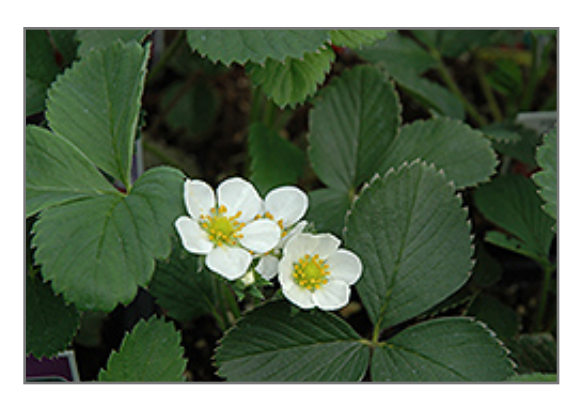
Allstar Strawberry flowers