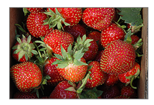
Allstar Strawberry fruit