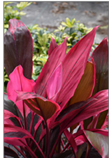
Red Sister Hawaiian Ti Plant foliage