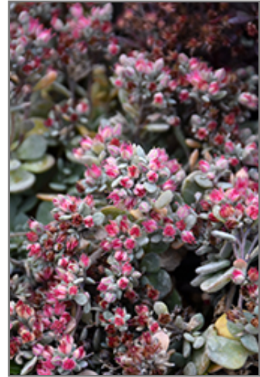
SunSparkler Blue Elf Sedoro flowers

SunSparkler Blue Elf Sedoro is a dense herbaceous perennial with a ground-hugging habit of growth. Its relatively fine texture sets it apart from other garden plants with less refined foliage.