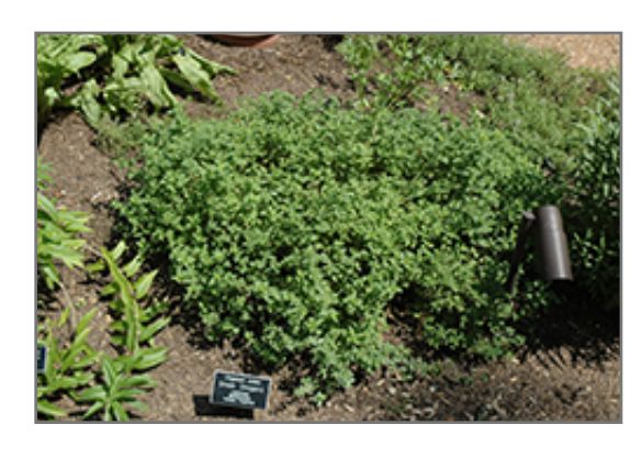
Greek Oregano

Greek Oregano will grow to be about 16 inches tall at maturity extending to 24 inches tall with the flowers, with a spread of 14 inches. When grown in masses or used as a bedding plant, individual plants should be spaced approximately 12 inches apart. Its foliage tends to remain dense right to the ground, not requiring facer plants in front. Although it's not a true annual, this fast-growing plant can be expected to behave as an annual in our climate if left outdoors over the winter, usually needing replacement the following year. As such, gardeners should take into consideration that it will perform differently than it would in its native habitat.