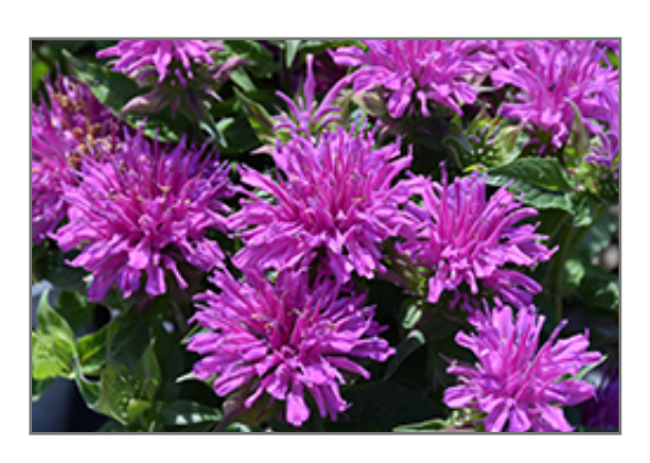
Balmy Lilac Beebalm flowers

Balmy Lilac Beebalm is recommended for the following landscape applications;