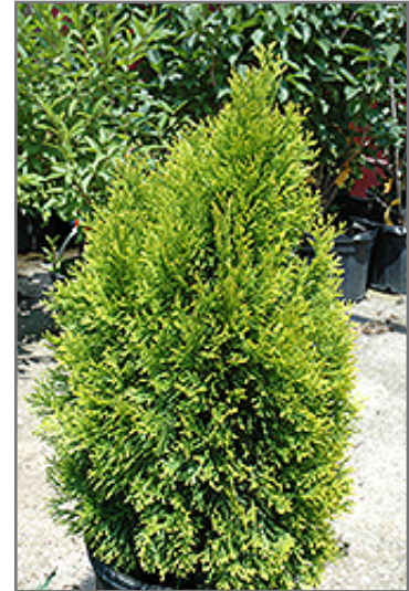
Highlights Arborvitae