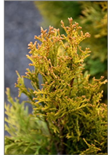
Highlights Arborvitae foliage

This tree does best in full sun to partial shade. It prefers to grow in average to moist conditions, and shouldn't be allowed to dry out. It is not particular as to soil type or pH. It is somewhat tolerant of urban pollution, and will benefit from being planted in a relatively sheltered location. Consider applying a thick mulch around the root zone in winter to protect it in exposed locations or colder microclimates. This is a selection of a native North American species.