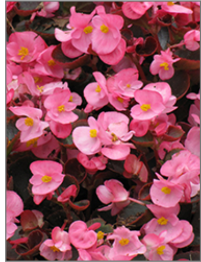
Bada Boom Pink Begonia flowers