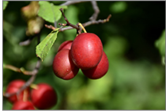
Toka Plum fruit