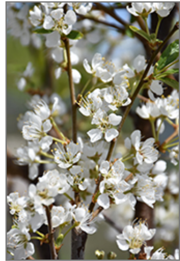
Toka Plum flowers