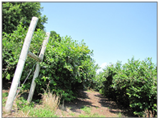
Chandler Blueberry fruit

1028 Hutchinson Rd. Lowbanks, ON NOA 1K0