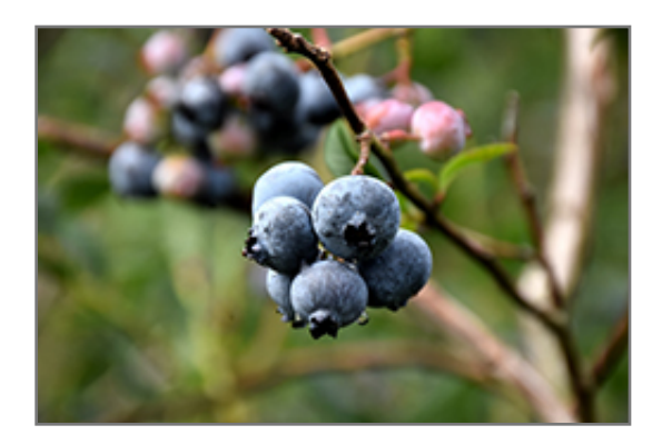
Chandler Blueberry fruit

Chandler Blueberry features dainty clusters of white bell-shaped flowers hanging below the branches in mid spring. It has bluish-green deciduous foliage. The oval leaves turn an outstanding red in the fall. It features an abundance of magnificent blue berries from mid to late summer. The smooth tan bark adds an interesting dimension to the landscape.