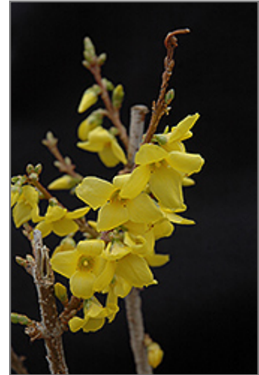
Show Off Forsythia flowers

Show Off Forsythia makes a fine choice for the outdoor landscape, but it is also well-suited for use in outdoor pots and containers. With its upright habit of growth, it is best suited for use as a 'thriller' in the 'spiller-thriller-filler' container combination; plant it near the center of the pot, surrounded by smaller plants and those that spill over the edges. It is even sizeable enough that it can be grown alone in a suitable container. Note that when grown in a container, it may not perform exactly as indicated on the tag - this is to be expected. Also note that when growing plants in outdoor containers and baskets, they may require more frequent waterings than they would in the yard or garden. Be aware that in our climate, most plants cannot be expected to survive the winter if left in containers outdoors, and this plant is no exception. Contact our experts for more information on how to protect it over the winter months.